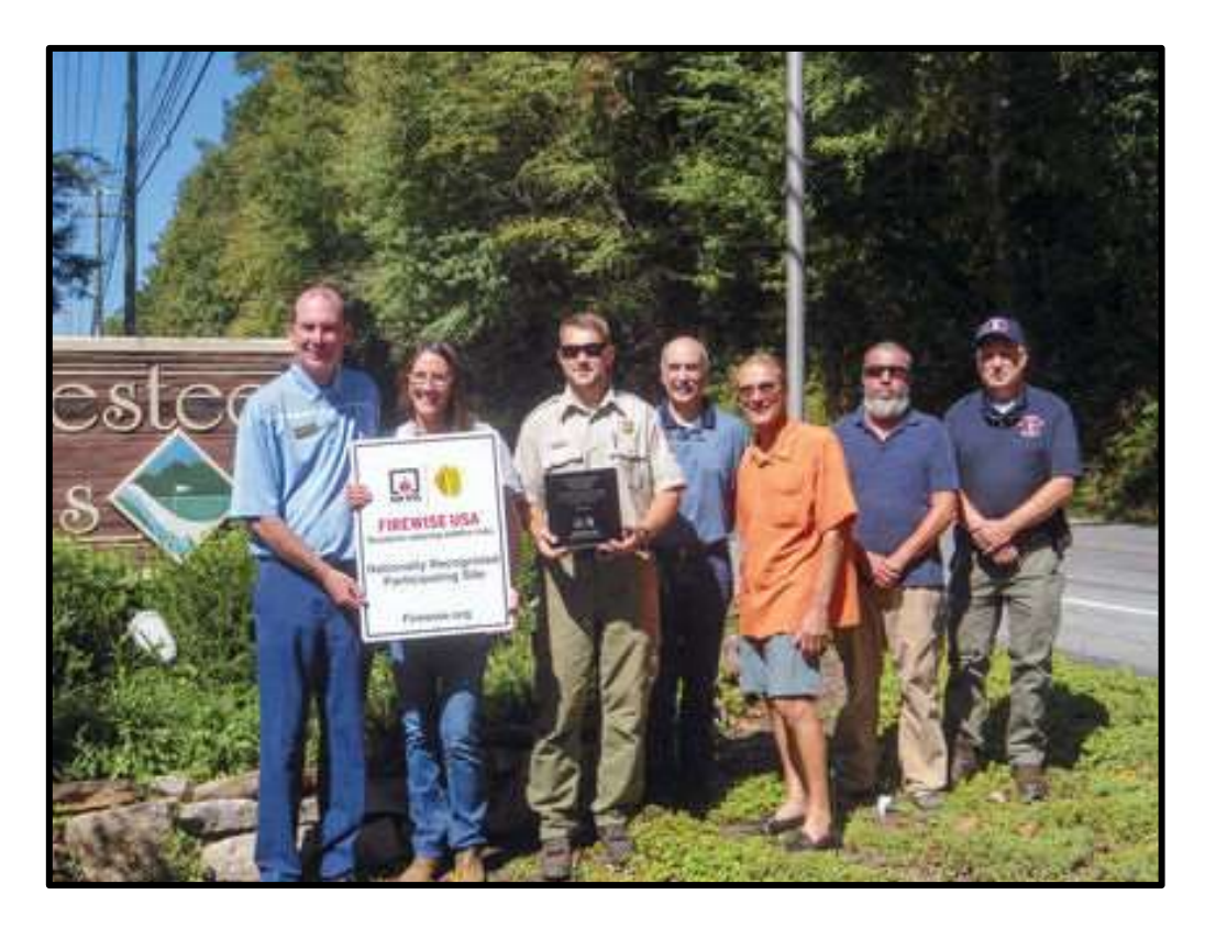
This could be your community!