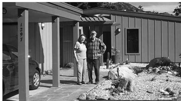
Top photo: The McClellan house on Las Canoas.