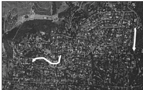
The upper photo shows the Heights in 1938 with four homes in the upper section (boxed) and two exits (white arrows). The lower photo was taken in 1990.