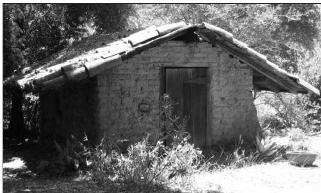
Who built this tiny adobe, found on the old Ullman estate off Las Canoas Road, why, and when are among the mysteries the History Project hopes to solve.

The amassing of such an ambitious history of Mission Canyon is a prodigious task. Ancient property records, maps, and surveys must be collected and examined for clues to our community's heritage. The culture and history of the Chumash, dating back 6,000 years, deserve attention, as they depict Mission Canyon as it existed long before Cabrillo sailed to our shores. With the Old Mission on our doorstep, the life and times of the Spanish soldiers and the Franciscan Fathers shaped our water systems and our property lines, and created our oldest still-extant structures.